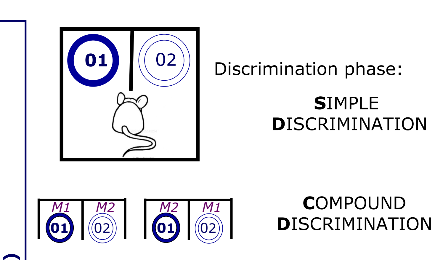
Table 1. Order of discriminations performed

Male Sprague-Dawley rats (Charles River, Germany) weighing 250-280 g on arrival were used in this study. Individual housing was maintained for the entire duration of the experiment. For one week prior to testing, rats were mildly food restricted (15 g of food pellets per day). Behavioral testing was performed during the light phase of the light/dark cycle. The experiments were conducted in accordance with the NIH Guide for the Care and Use of Laboratory Animals and were approved by the Ethics Animal Experiments, Institute of Committee for Pharmacology